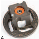
A 50-687 4-Lug Adapter

Fits most smaller cars with 4-lug patterns such as Hyundai Elantra and Toyota Yaris.