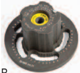
B 50-688 5-Lug Adapter

Fits most smaller cars with 4-lug patterns such as Hyundai Elantra and Toyota Yaris.