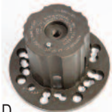
D 50-691 1/2 Ton Truck Adapter

Fits many smaller trucks and SUVs such as the Dakota and Envoy, and larger cars such as the Chrysler 300 and Buick LeSabre.