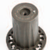
E 50-694 1/2 Ton Truck Adapter with F150

Fits most pickups and SUVs in the 1/2-ton range including older Ford F150 and GM Acadia.