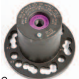
C 50-695 5 & 6 Small Truck/Large Car Adapter

Fits most mid-sized cars with 5-lug patterns such as Toyota Camry, Honda Accord, Chevy Malibu.