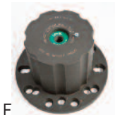
F 50-683 HD Truck Adapter

Has many 1/2-ton truck and SUV patterns such as the newer Ford F150 and GM Acadia.