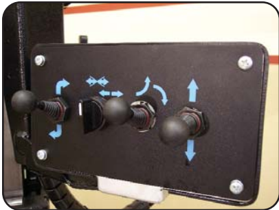
Operator control panel.