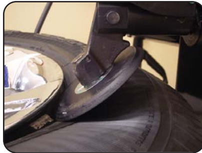
Polymer disc won't damage wheels or tire sensors.